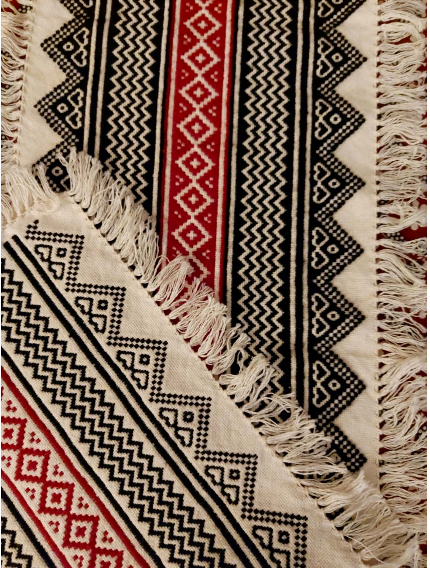
Image: Toda embroidery.

and red thread; white represents purity, red youth, and black wisdom. The neatness of the work makes the textile reversible: the main face has a heavier look and the reverse a lighter look.